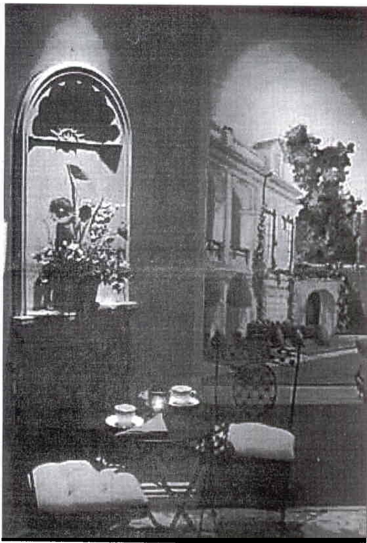
TALEGA DAY SPA offers a holistic haven to residents.

Guests of Talega Day Spa have use of the spa amenities including the dressing rooms, robes and sandals, as well as time in the Swiss showers, steam rooms, infra-red sauna, relaxation room, and outdoor lounge.